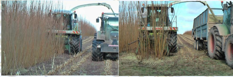
Table 1. Yield and dry matter at harvest from the leading Short Rotation Coppice willow varieties. Genetic Diversity Group (colour code), Breeder and Gender are added to aid selection and sourcing of a diverse mixture.